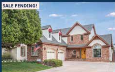
83 West Cypress 3,350sq' 3br/2.5ba/2CG $1,250,000