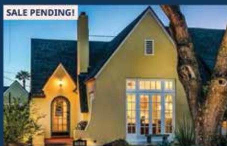
107 West Granada 1,238sq' 2br/1ba + 500' casita $800,000