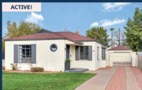
516 West Lewis 1,240sq' 2br/1ba/2CG $575,000